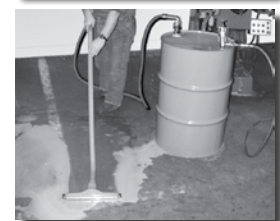
Model 6901 Spill Recovery Kit.