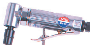
9910007 1/4" Angle Die Grinder