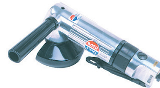
9910012 4" Angle Grinder