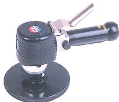
16013 6" Dual Action Sander