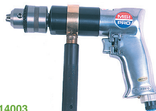
14003 1/2" Reversible Drill