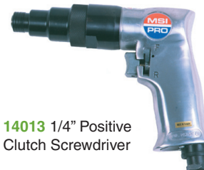
14013 1/4" Positive Clutch Screwdriver