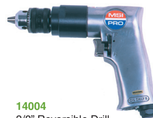
14004 3/8" Reversible Drill