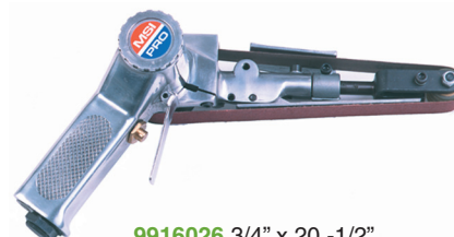
9916026 3/4" x 20" -1/2" Mini Belt Sander