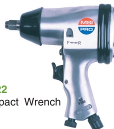
9915022 1/2" Impact Wrench