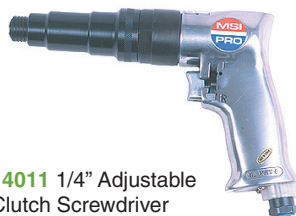
14011 1/4" Adjustable Clutch Screwdriver