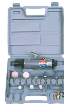
9918008 1/4" Die Grinder Kit