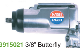
9915021 3/8" Butterfly Impact Wrench