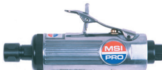
9010025 1/4" Die Grinder