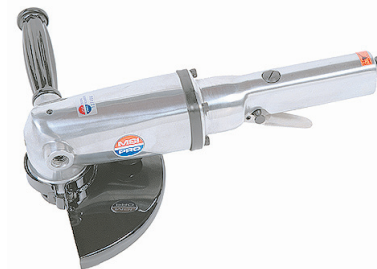
10013 7" Angle Grinder