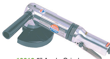
10019 5" Angle Grinder