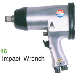
15016 3/4" Impact Wrench