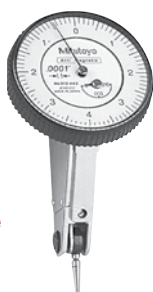
513-443 White Face