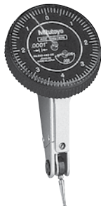
513-443-06 Black Face