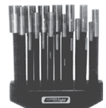
Blind Hole Set