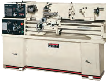
(Shown with optional Stand)

Please inquire for possible "promo" pricing.