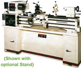
(Shown with optional Stand)

Please inquire for possible "promo" pricing.