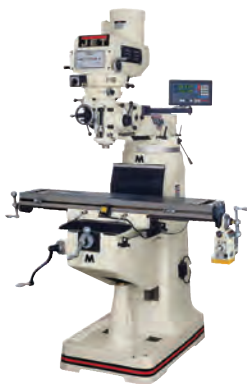
(Shown with optional DRO & Powerfeed).

Please inquire for possible "promo" pricing.