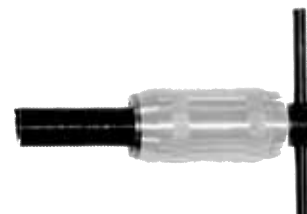
Type 4 - Non-Captive Prewinder