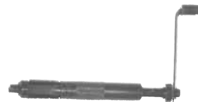
Type 2 - Hand Inserting Tool (Prewinder Tool)