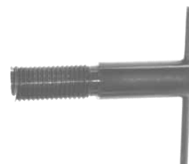
Type 3 - Installation Tool (Threaded Mandrel)