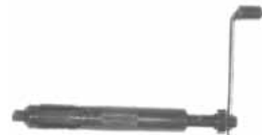
Type 2 - Hand Inserting Tool (Prewinder Tool)